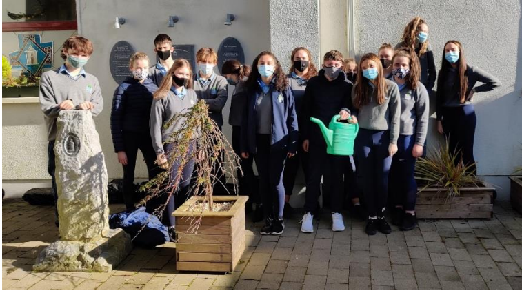
The Holocaust Crocus Project