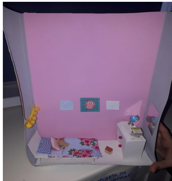
A lovely bedroom design by Aimee Madden 3B