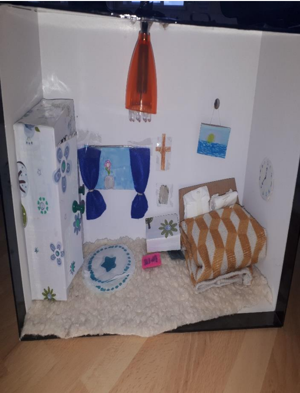
A beautiful interior design project by Chloe McPadden 3A