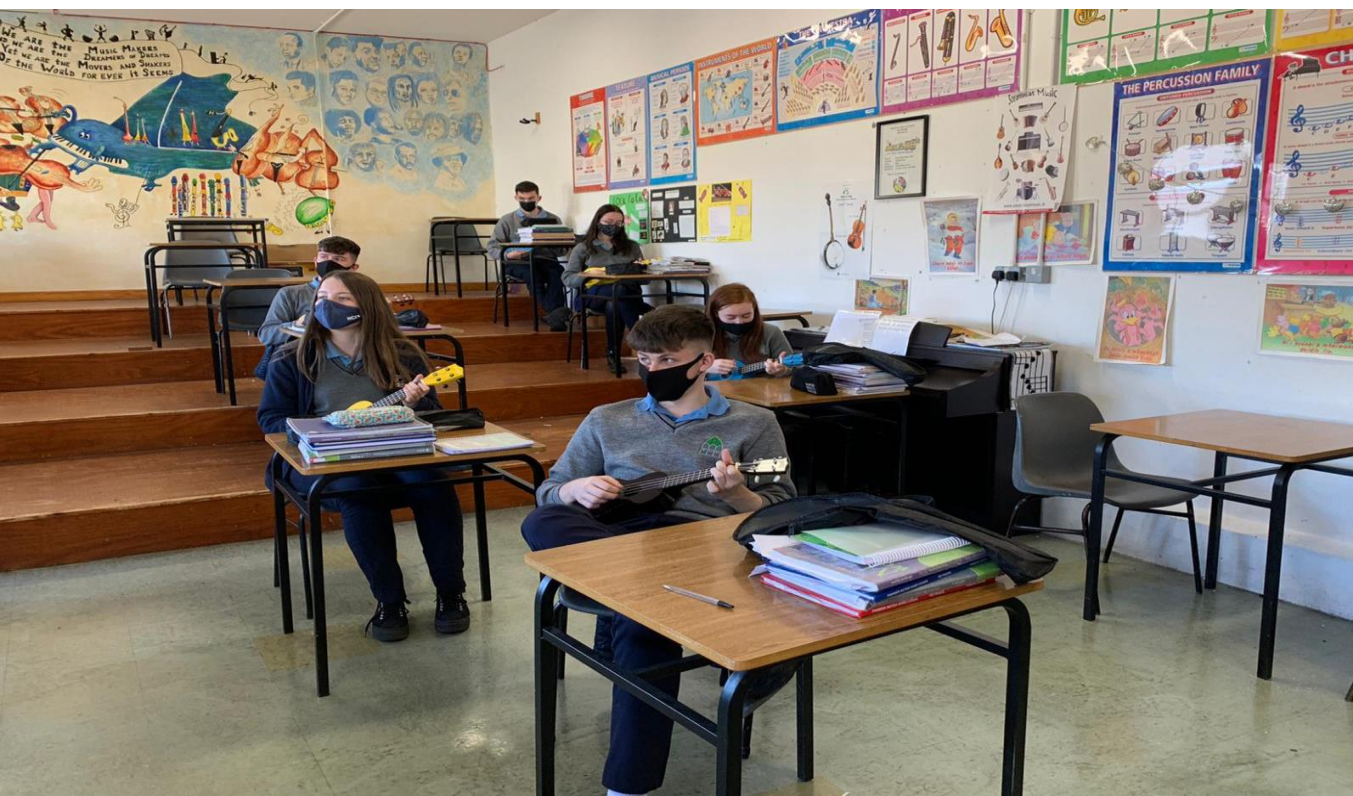
And finally, some leaving certs kicking back and chilling with their Ukeleles!